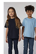
SOL'S Imperial KIDS 11770