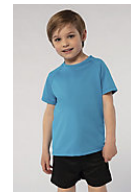
SOL'S SPORTY KIDS 01166