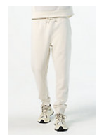
SOL'S JUMBO 03810