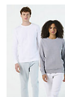
SOL'S COMET 03574