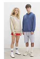
SOL'S CONSTELLATION 04232