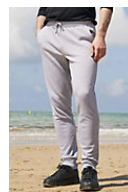
SOL'S JET MEN 03808