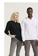
SOL'S PLANET LSL 04241