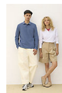
SOL'S PACIFIC LSL 04441