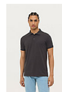
SOL'S PRIME MEN 00571