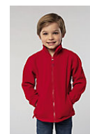
SOL'S NORTH KIDS 00589