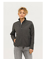
SOL'S FALCON WOMEN 03828