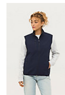
SOL'S FALCON BW WOMEN 03826