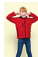
SOL'S REPLAY KIDS 46603