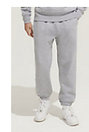
SOL'S CENTURY 03992