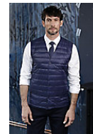
NEOBLU ARTHUR MEN