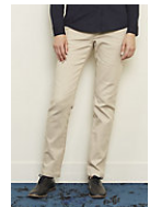
NEOBLU GUSTAVE WOMEN