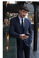
NEOBLU MARCEL MEN