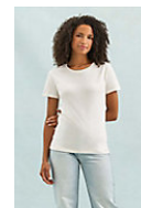
SOL'S Imperial WOMEN 11502