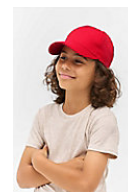
SOL'S BUZZ KIDS 04745